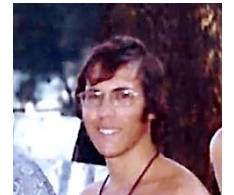
Camp Hillel 1973